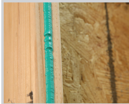
Stud Face to Drywall Gasket