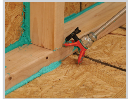
Base Plate to Subfloor Seal