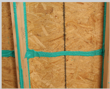
Sheathing Seam Seal