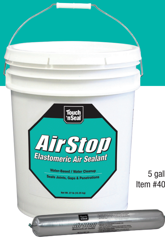
5 gallon pail Item #4005550005