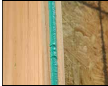
Stud Face to Drywall Gasket