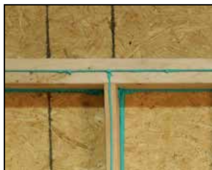
Double Top Plate Seal

Use AirStop to seal joints, seams and penetrations in the building envelope. Apply AirStop after electrical and plumbing and before insulation and drywall. Recommended airless sprayer tip is 315. Use in the following applications: