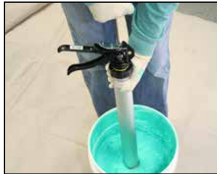
AirStop can be bulk-loaded into a sausage gun for manual application.

A sausage (caulk) gun is an easy alternative to using an airless sprayer, which also greatly shortens set up and clean up times. The gun's low-pressure gives you tighter control over aim and still allows you to apply AirStop anywhere an airless sprayer would.