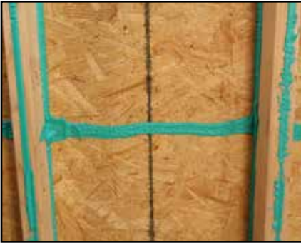
Sheathing Seam Seal