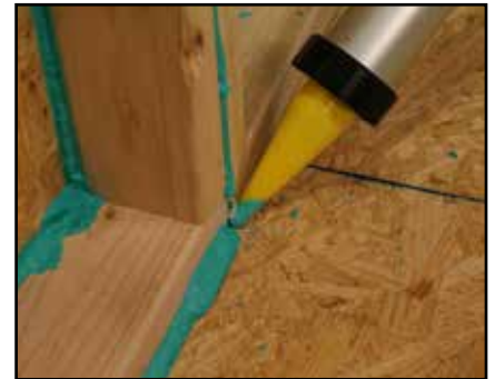
Sausage gun is an easy alternative to using an airless sprayer.