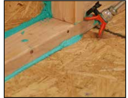
Base Plate to Subfloor Seal