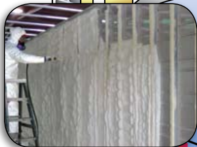
Side wall strengthening & insulation