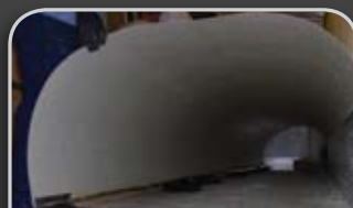
2 Align fiberglass liner and attach