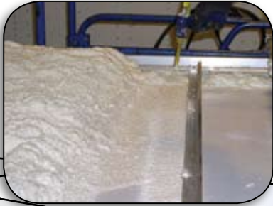
Fast and efficient roof repair

Class I certified, 1.75 pcf. Refillable units from 17 to 120 gallons, and disposable kits ranging from 200 - 750 board feet