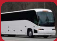
Buses and RVs