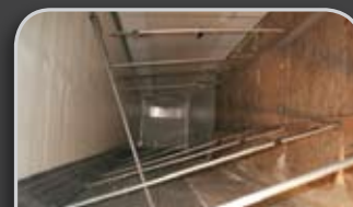
3 Brace and let cure

Caution: Contents under pressure. Contains polyisocyanates, may be irritating to eyes, skin and respiratory tract. Use only with adequate ventilation. Wear protective clothing, safety glasses and gloves. See Material Safety Data Sheet for additional information.