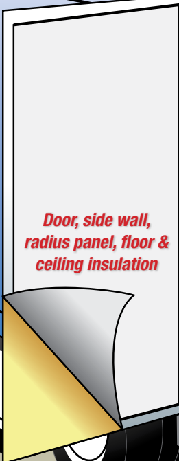
Door, side wall, radius panel, floor & ceiling insulation