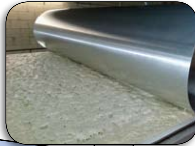
Liner Bond permanently bonds aluminum roofs and inside liner panels