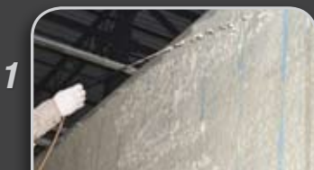
1 Spray on prepared surface